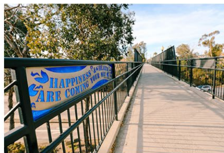
Vermont Street Bridge