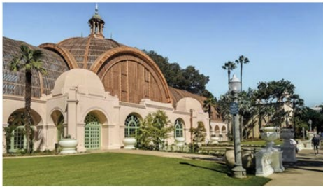
Botanical Garden Building

After gathering at the church and taking a quick 15-minute drive to Balboa Park, attendees will then take the tram to the park's center. Enjoy strolling through the Rose Garden, the Desert Garden and on to the newly remodeled Botanical Garden building. This is a flat, easy walk.