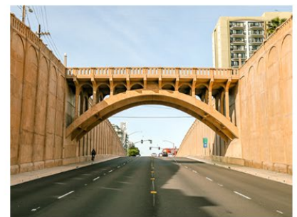
Georgia Street Bridge